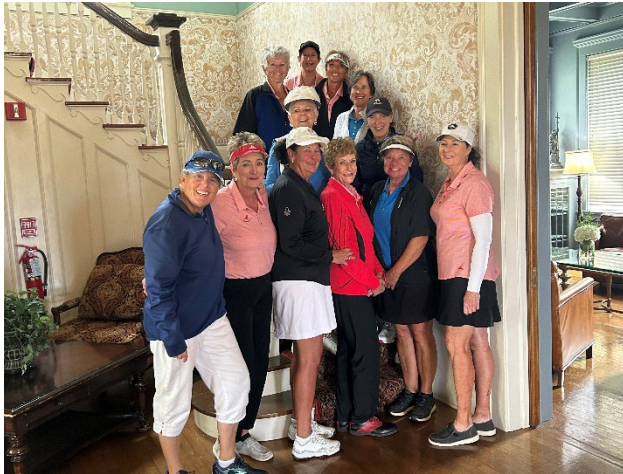
Team Riverhill pictured with team Ladybird following play on 4/23/24.