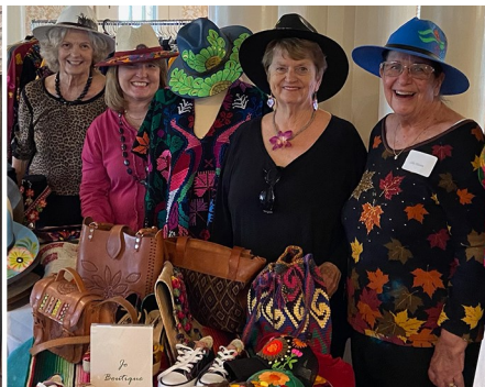
RWA Ladies Hat Shopping At Mini Market