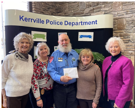
RWA Raises $1025 For Blue Santa