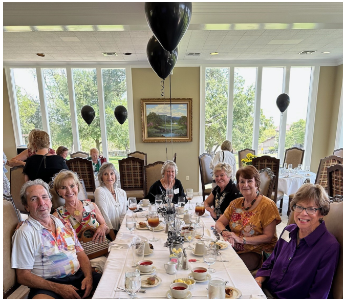
Members of Riverhill Women's Association are enjoying the September Luncheon and Meeting.